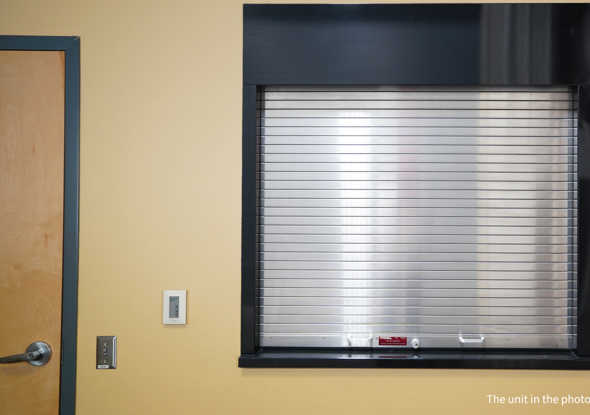
The unit in the photo is shown with optional black powdercoat.

Model ESC20 with frame and integrated sill